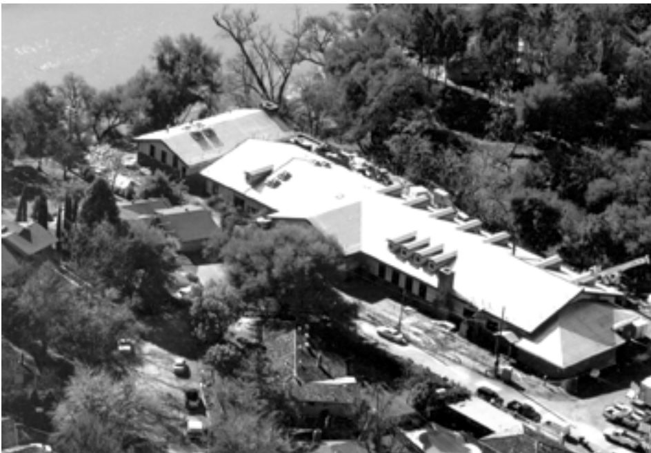
The architectural style of the new treatment plant is now evident. Crews still need to paint, install flooring and landscape the grounds to complete the “residential” look of the new building.